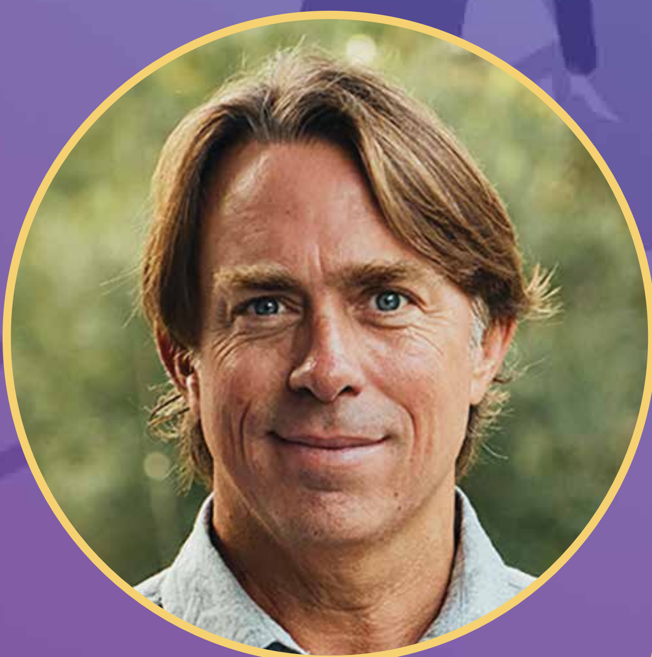
CHEF JOHN BESH BRG Hospitality's Award-Winning New Orleans Restaurants