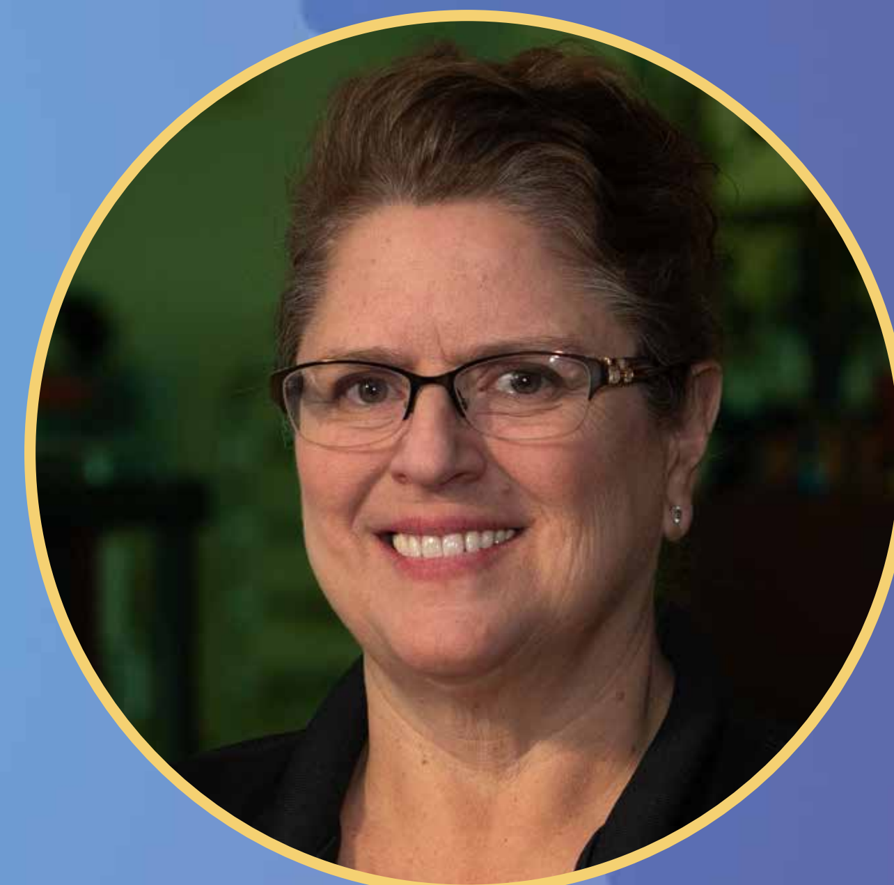
Chrisoula Hulion CHRISOULA'S CHEESECAKE SHOPPE