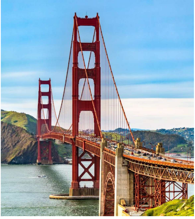
8 Days • 12 Meals: 7 Breakfasts, 2 Lunches, 3 Dinners

HIGHLIGHTS... Monterey, Scenic 17-Mile Drive, Yosemite National Park, Sacramento, Choice on Tour: California State Railroad Museum or Crocker Art Museum, Lake Tahoe Scenic Cruise, Napa Valley Vineyard Tour and Wine Tasting, San Francisco