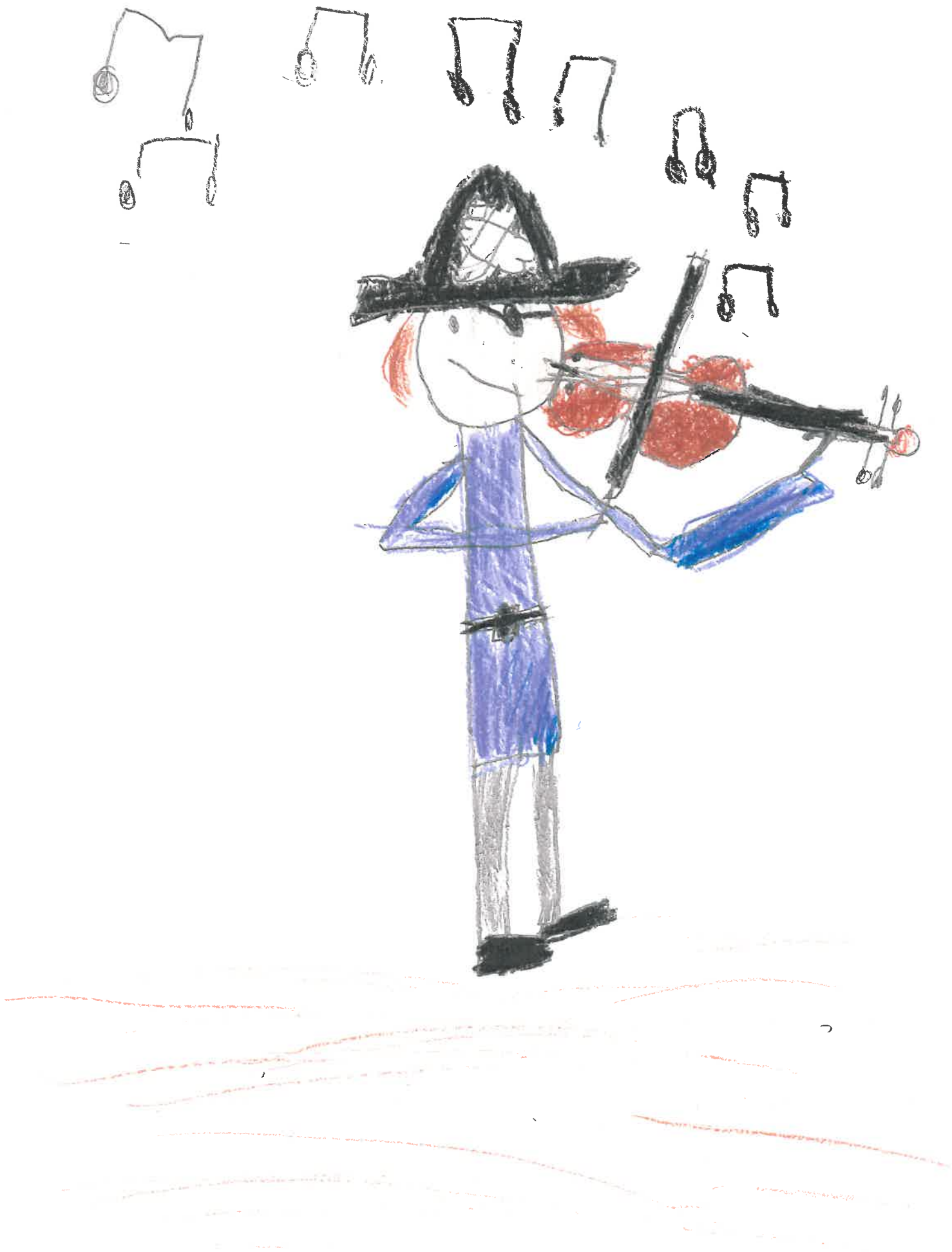
Right away they unpacked their fiddles, put on their new clothes, and started playing pirate songs. They cheered that Captain Adventure the seven year old is the bravest and best captain.