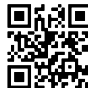
UNR Career Exploration and Preparation