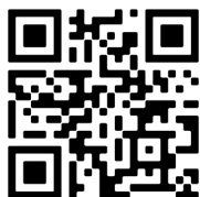
TMCC Career Mapping

To explore career maps from some local Nevada educational institutions, check out these links: