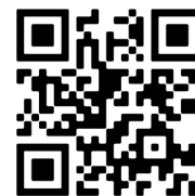
UNR Career Exploration and Preparation