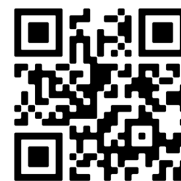
UNR Career Exploration and Preparation