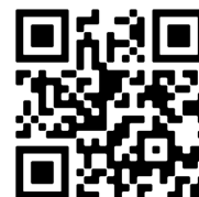
UNR Career Exploration and Preparation