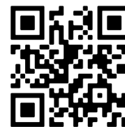
UNR Career Exploration and Preparation