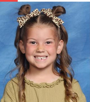
2025 1 st Place Kindergarten