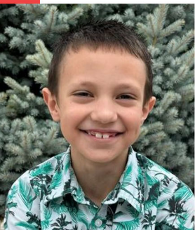
2025 1 st Place First Grade