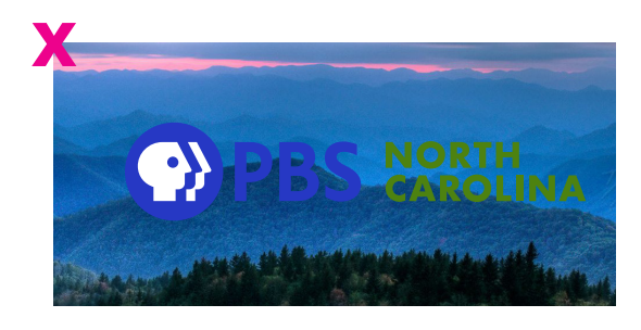
Do not use the full color version on dark area of a photo or a dark color.