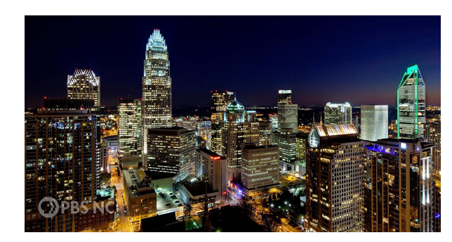
For transulcent applications, use the black and white logo at 25% opacity. (ex: social watermarks and digital video)