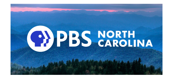
Use the white outlined version on a dark area of a photo or a solid color.