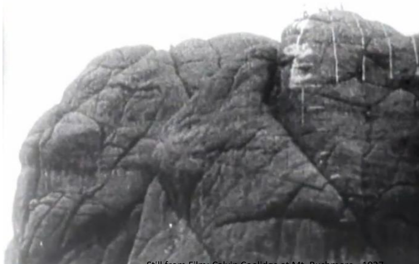
Still from Film: Calvin Coolidge at Mt. Rushmore - 1927

The following film ( Watch PBS (the film is silent)) was recorded on August 10, 1927, showing President Calvin Coolidge riding a horse to the dedication of the Mount Rushmore site. There are also views of Mount Rushmore as it looked before carving began (photo above). In the next clip, a narrator provides some detail about the events of the dedication. Coolidge addressed the assembly and presented sculptor Gutzon Borglum with steel drill bits, symbolically providing the tools to get the carving underway. ( Watch PBS/ Photos & Article )