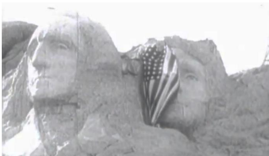
Still from Film: FDR at Mount Rushmore - 1936

On August 30, 1936, President Franklin Delano Roosevelt visited the Black Hills to dedicate the Jefferson sculpture. Roosevelt was already in the region on a tour of Great Plains states hard-hit by the drought of the 1930s.