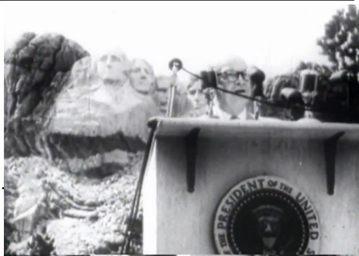
Still from Film: Dwight Eisenhower at Mt. Rushmore

President Eisenhower addressed the Delegates at a gathering at Mount Rushmore. In the following clip ( Watch PBS ), Eisenhower is seen speaking and mixing with a crowd. There are also shots of Eisenhower fishing, most likely in a stream in Custer State Park. The film is silent. A transcript of the speech is available online here .