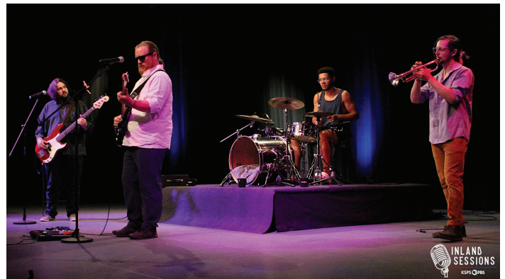
The Red Books will kickstart season four of Inland Sessions October 9, 2023 on KSPS PBS

SPOKANE, WA — KSPS PBS, the Inland Northwest's premier public television station, is thrilled to announce the upcoming season of its beloved program, Inland Sessions . This captivating series continues to showcase the exceptional talents of artists from the Inland Pacific Northwest. Inland Sessions provides a unique platform for regional artists to shine, and the upcoming season promises to be no different, with a stellar lineup of diverse and talented performers.