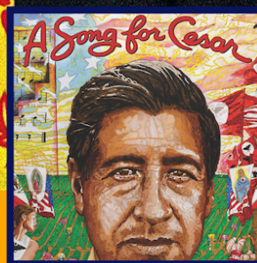
American Masters: A Song for Cesar FRI Sep 29 | 9p