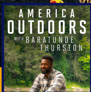
America Outdoors SEASON 2 PREMIERE WED Sep 6 | 7p