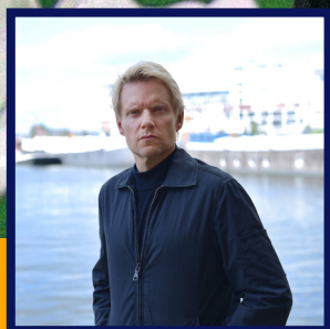
Van Der Valk SEASON 3 PREMIERE SUN Sep 3 | 9p