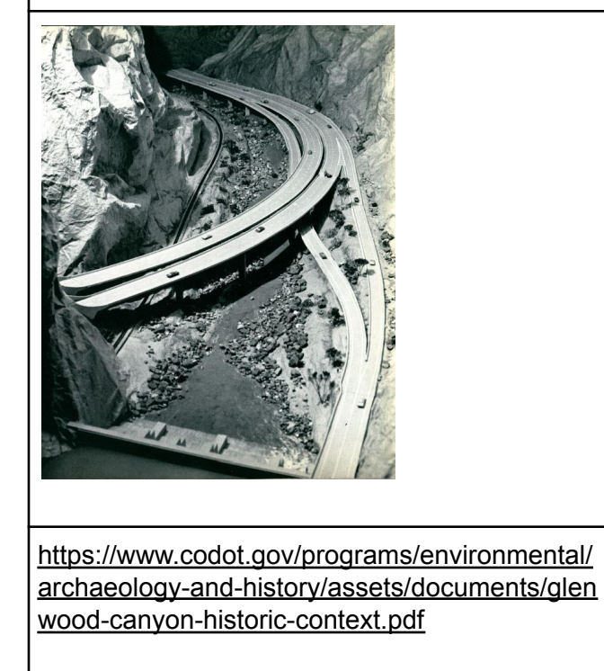
Photo of model of Hanging Lake area showing problems of building multiple lanes plus exit ramps in a narrow canyon without blowing up walls