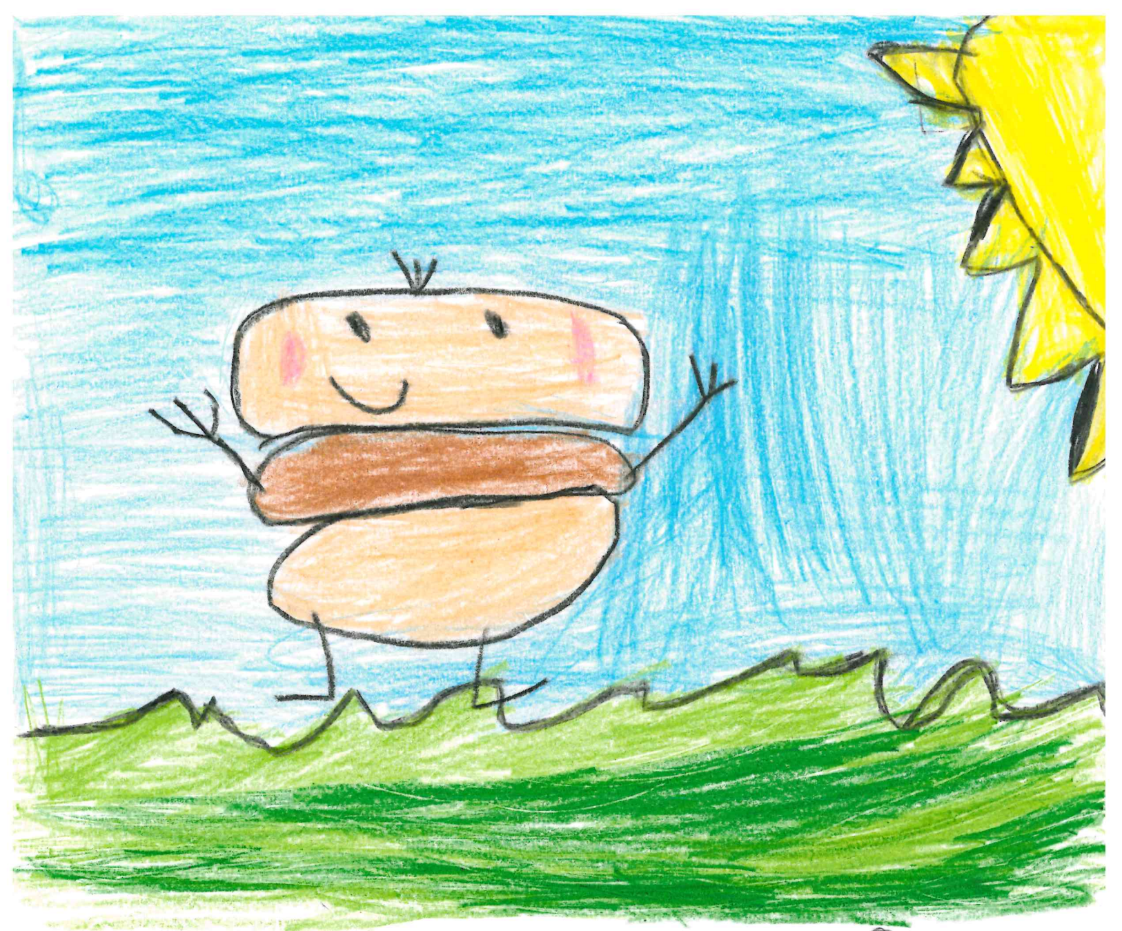
Himyname is Cheesy. I am a han burger.