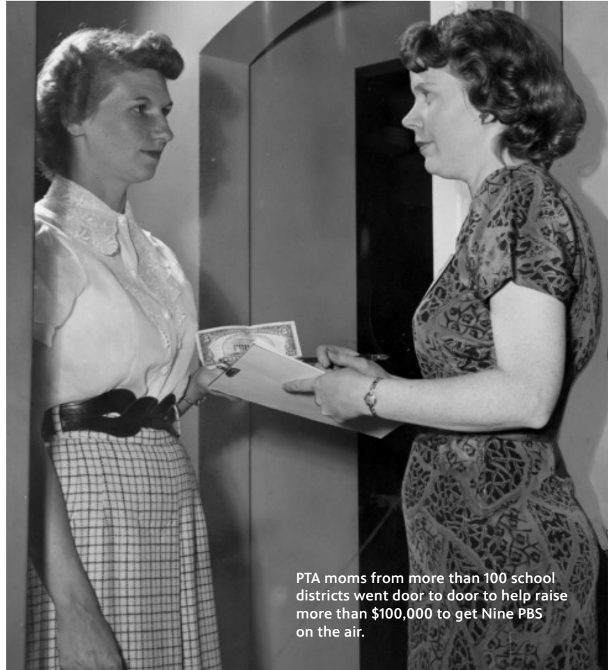
PTA moms from more than 100 school districts went door to door to help raise more than $100,000 to get Nine PBS on the air.

In 1951, the Federal Communications Commission (FCC) sent a letter to the mayors of cities across the United States that asked: “If a channel were reserved for educational television in your city, would your community use it?”