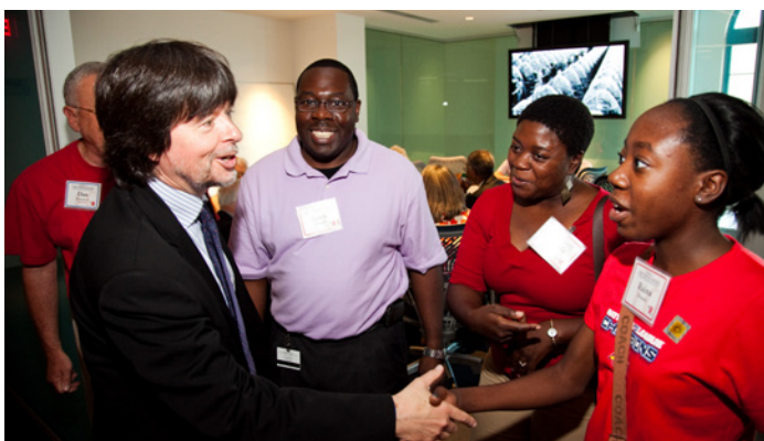
We have had the pleasure of hosting Ken Burns (pictured here greeting guests in 2010) multiple times in our studio.

➤ For nostalgia-loving members and friends, don't miss our video about serving St. Louis for 70 years at ninepbs.org/70.