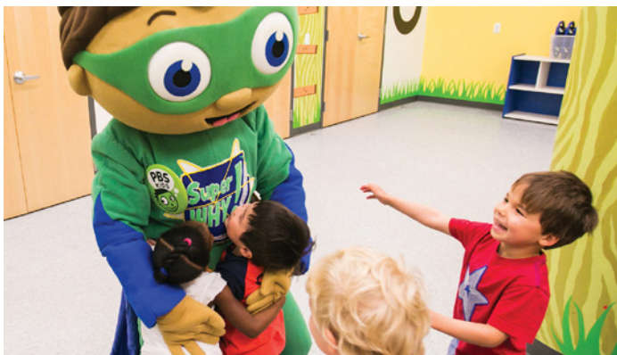
The reading-powered superhero, Super Why!, greeted fans at a Nine PBS early learning event in 2016.

While the television landscape and St. Louis skyline have changed a lot in the past 70 years, the community's generous and enthusiastic support of Nine PBS has been a constant.