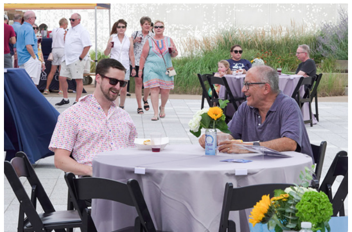
70, Ale Yeah! blonde ale was a hit with members and friends who came out on a Saturday afternoon to enjoy our birthday beer collaboration with 4 Hands Brewing Co. on June 22.