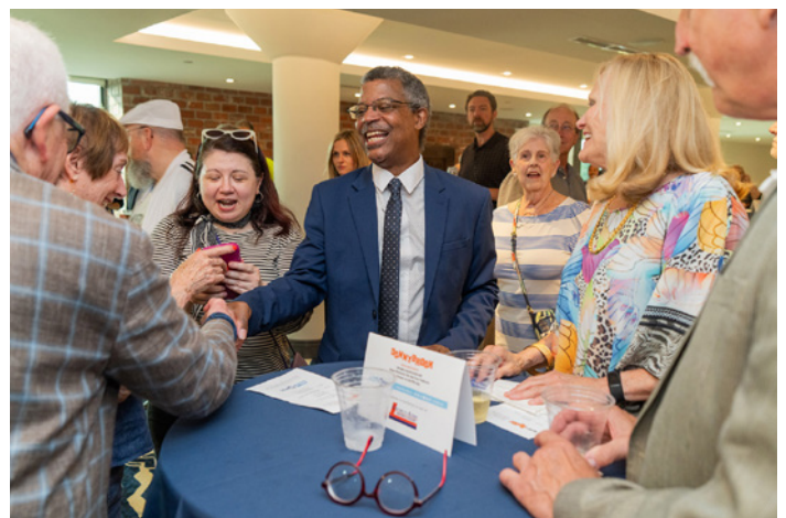
Our Donnybash Live 2023 membership event at The Sheldon Concert Hall in June was lots of fun. Get your tickets for the April 2024 event at ninepbs.org/donate .