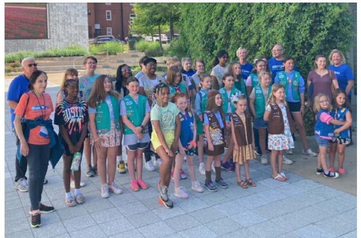
Our volunteers were on hand in June when the Girl Scouts of Eastern Missouri Media Team visited our studios to learn more about video shoots, TV interviews, and more.