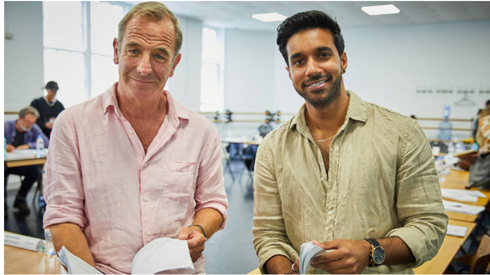
Robson Green (left), who plays Detective Geordie Keating, and the new vicar in town, Rishi Nair.

"I'm absolutely thrilled to be joining Grantchester ," says Nair. "The welcome and support I've received from everyone has been overwhelming. ...I'm really excited to get started and cannot wait for the Grantchester fans to meet Alphy and to see all that's in store for him."