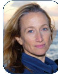
CÉLINE COUSTEAU Explorer & Filmmaker April 9, 2024