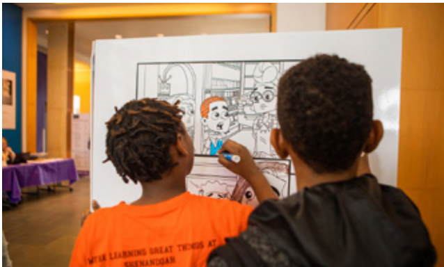
Children creating their own stories at the January Exploration Day at the Missouri History Museum.

Drawn In is anchored to the community; we regularly convene with more than 40 trusted partners in early education. These conversations are an opportunity to understand community priorities, develop programming and curriculum tied to these priorities, engage the broader community, and, later, measure the impact of our efforts to inform future content, engagement, and dialogue.