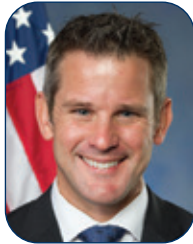
ADAM KINZINGER Fmr. US Congressman Jan. 6 Committee November 14, 2023