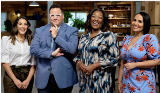
The host of The Great American Recipe Alejandra Ramos (far right) and judges and mentors (from left) Leah Cohen, Graham Elliot, and Tiffany Derry return for Season 2.