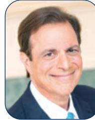
MICHAEL BESCHLOSS Presidential Historian March 19, 2024