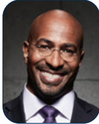
VAN JONES Emmy Award-Winning Journalist October 24, 2023