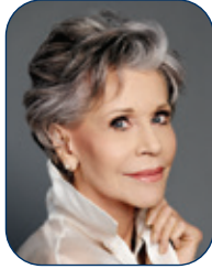
JANE FONDA Academy Award-Winning Actor October 5, 2023