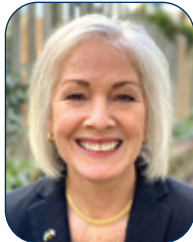
MARIE YOVANOVITCH Fmr. US Ambassador to Ukraine January 23, 2024