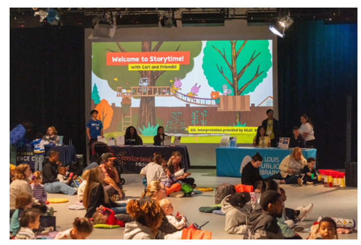
Storytime in April included sensory-friendly spaces, games and activities, and community partners that celebrated the adventures of Carl, a warm-hearted autistic raccoon and the star of the PBD KIDS' series, Carl the Collector .