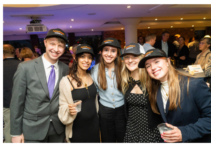
Donnybash in May was a high-energy member event that brought the community together for a live taping of public television's longest running public affairs program, Donnybrook .

©2025 St. Louis Regional Public Media Inc. All rights reserved. Reproduction of any portion of Nine PBS Magazine without expressed written permission from the publisher is prohibited.