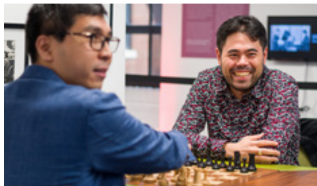
American chess grandmaster Christopher Hikaru Nakamura (right) plays a match.