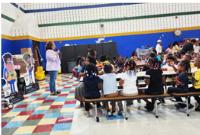
The Nine PBS team visited the Vivian Adams Early Childhood Center in East St. Louis, IL, to share our love of learning and to provide literacy resources.