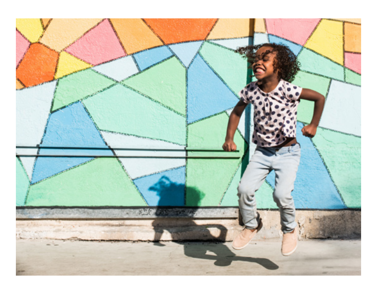
Nine PBS's Mental Well-Being Initiative is supported by the Cigna Foundation's Healthier Kids for Our Future grant in partnership with Behavior Health Response.