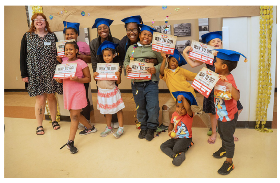
Nine PBS hosted a graduation ceremony at the Missouri History Museum for young learners who participated in our Family and Community Learning series of workshops.

Thank you to this group of key community partners that continues to be deeply invested in transformational collaboration with Nine PBS.