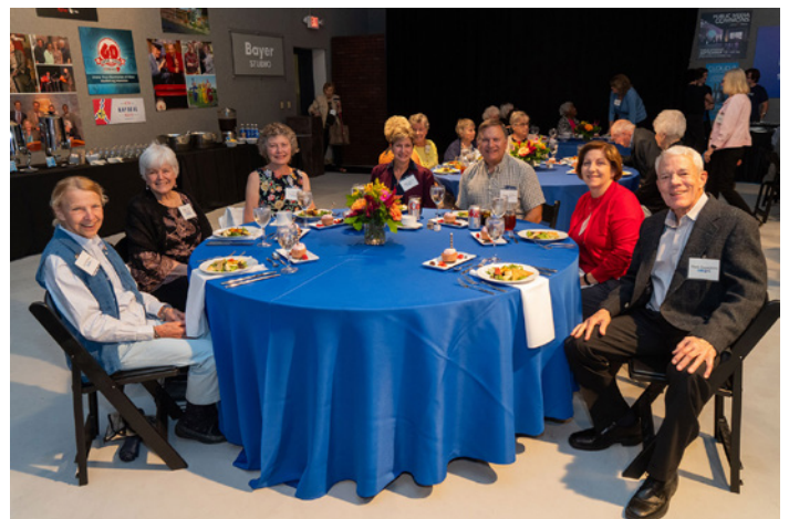
The 2023 Raymond H. Wittcoff Legacy Luncheon on September 20 included clips of our fall lineup and a heartfelt thank you to our Nine PBS Legacy Society members.