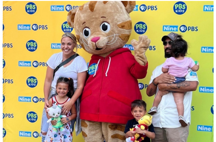
September's Storytime in the Commons/Be My Neighbor Day was a hit with young readers and families.