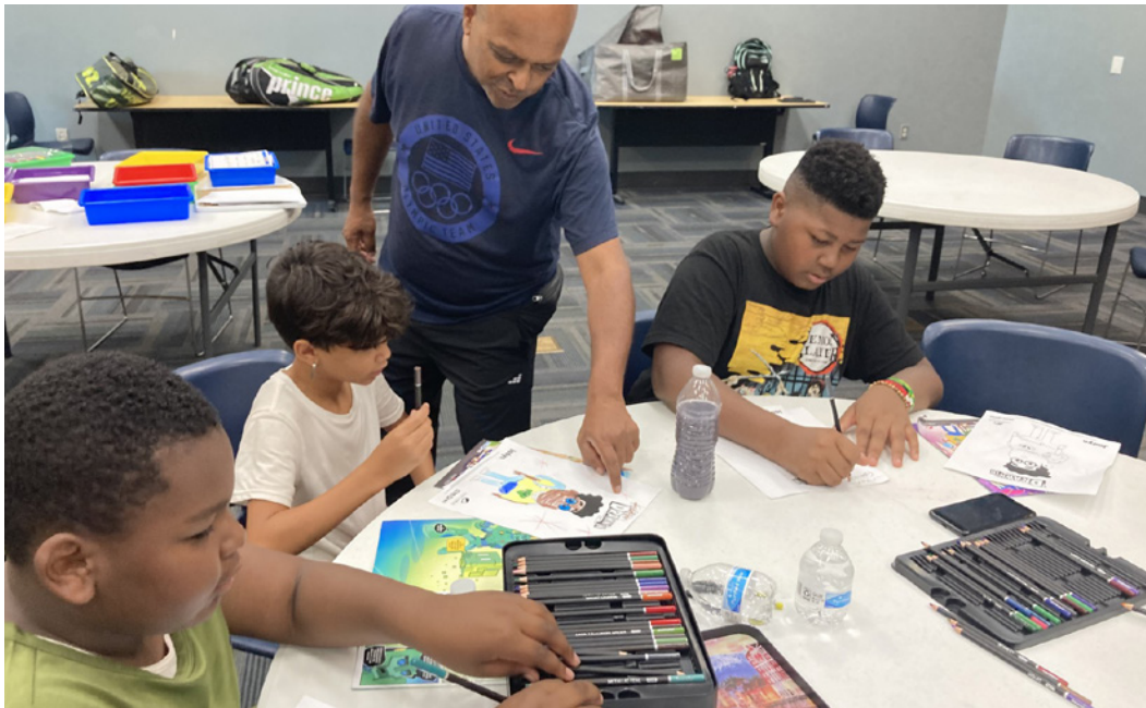
A Breakpoint Tennis & Life Skills Academy coach encourages campers working on comics at the Boys and Girls Club of Greater St. Louis this past summer.

“Drawn In is an incredible addition to our program at Breakpoint. Literacy is an integral part of our campers’ lives and we’re thrilled to implement a culturally competent curriculum that reflects the kids we support.”