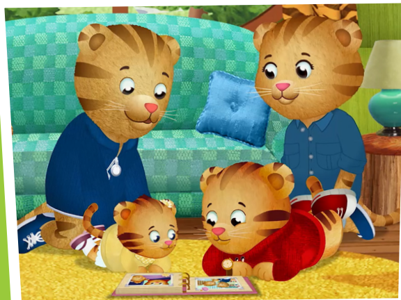
Daniel Tiger's Neighborhood