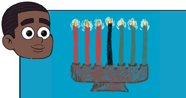
During Kwanzaa, my family lights special candles on the kinara each day to uplift our cultural values!