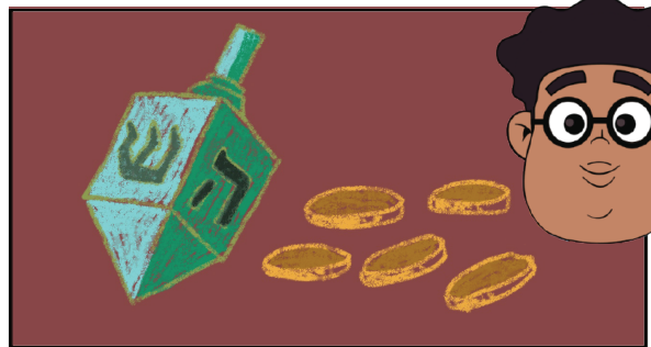
My neighbors invite my family to celebrate Chanukah every year. We play Dreidel and win chocolate gelt!