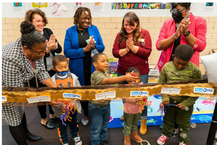
Nine PBS Fellows developed community hubs within partnering organizations that help connect young children to PBS KIDS® resources.