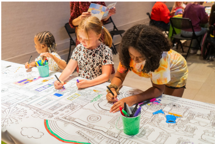
Kids enjoy the activities at Nine PBS Family Sunday at the Saint Louis Art Museum in September.