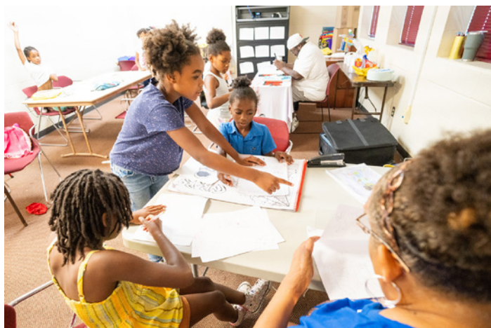
Campers at Breakpoint Academy got to level up their tennis, STEM, and reading skills with resources from Nine PBS’s Drawn In .