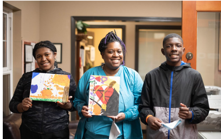
Paint night at the Tacoma Rescue Mission for families experiencing challenges.

KBTC celebrates the diversity of our community by spreading awareness through trusted and credible information that illuminates paths to social discourse.