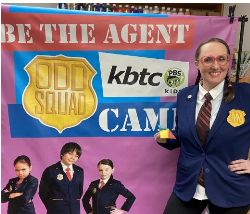
Agent Smiley on the case!

KBTC , in partnership with Tacoma Public Schools, piloted a virtual, after-school program for school children. The Curriculum was inspired by PBS kids programs Odd Squad and Wild Kratts . Approximately 60 students were served with over 80 hours of educational programs.