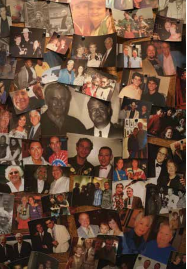
Viewers are encouraged to send in their photos with celebrities. Here are a few keepers.