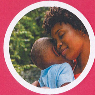
Difficult Times & Tough Talks