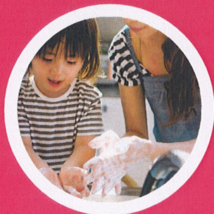
Healthy Bodies, Healthy Minds