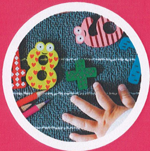
ABC's & 123's